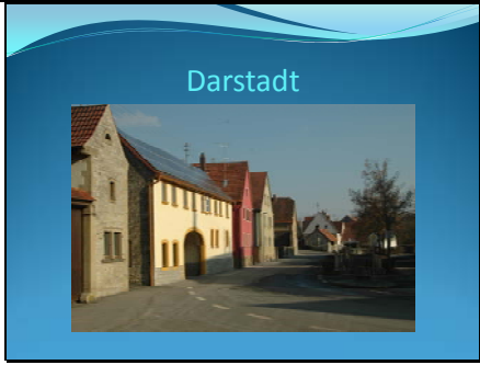
Looking into the village from the Darstadt castle

S l i d e 1 6 S l i d e 1 7 S l i d e 1 8 S l i d e 1 9 S l i d e 2 0