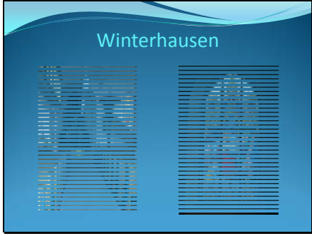
Interior of the church at Winterhausen.