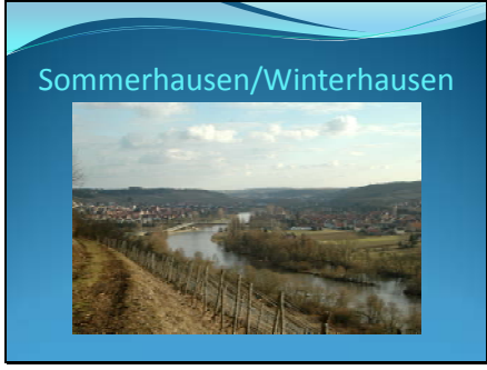
Sommerhausen on the left and Winterhausen on the right.