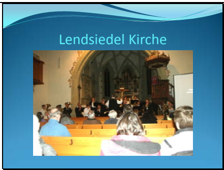
Brass band concert in Lendsiedel. Beer was served at the intermission!